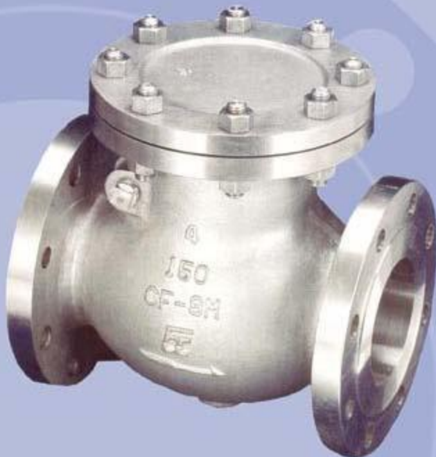
FIG. 45-300, STAINLESS STEEL - CLASS 300

FIG. 45-150, STAINLESS STEEL - CLASS 150