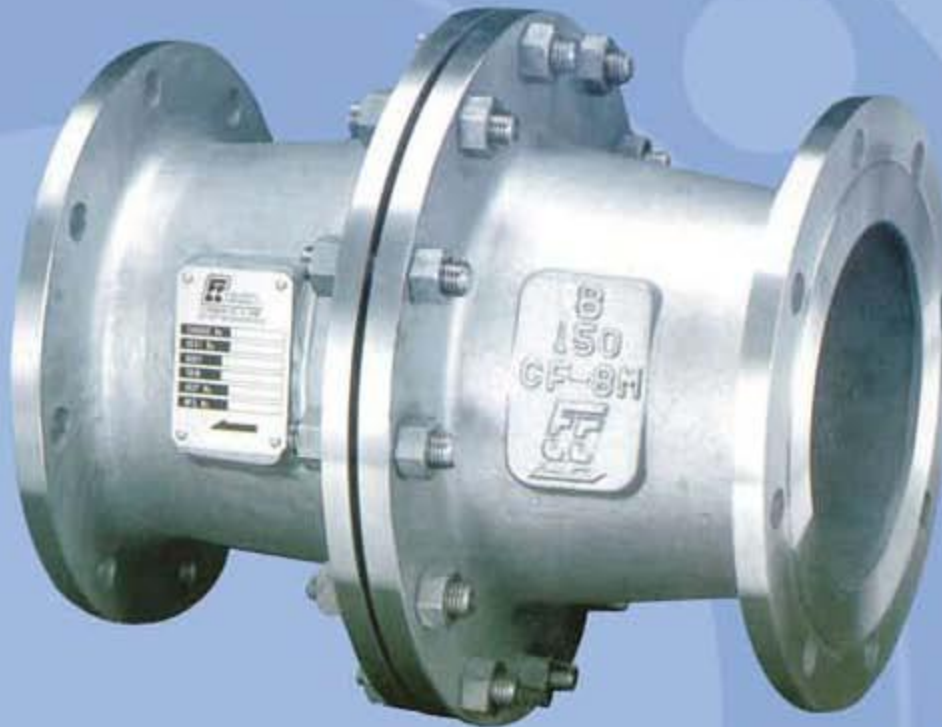
FIG. 40, ALL CAST S.S. CONSTRUCTION