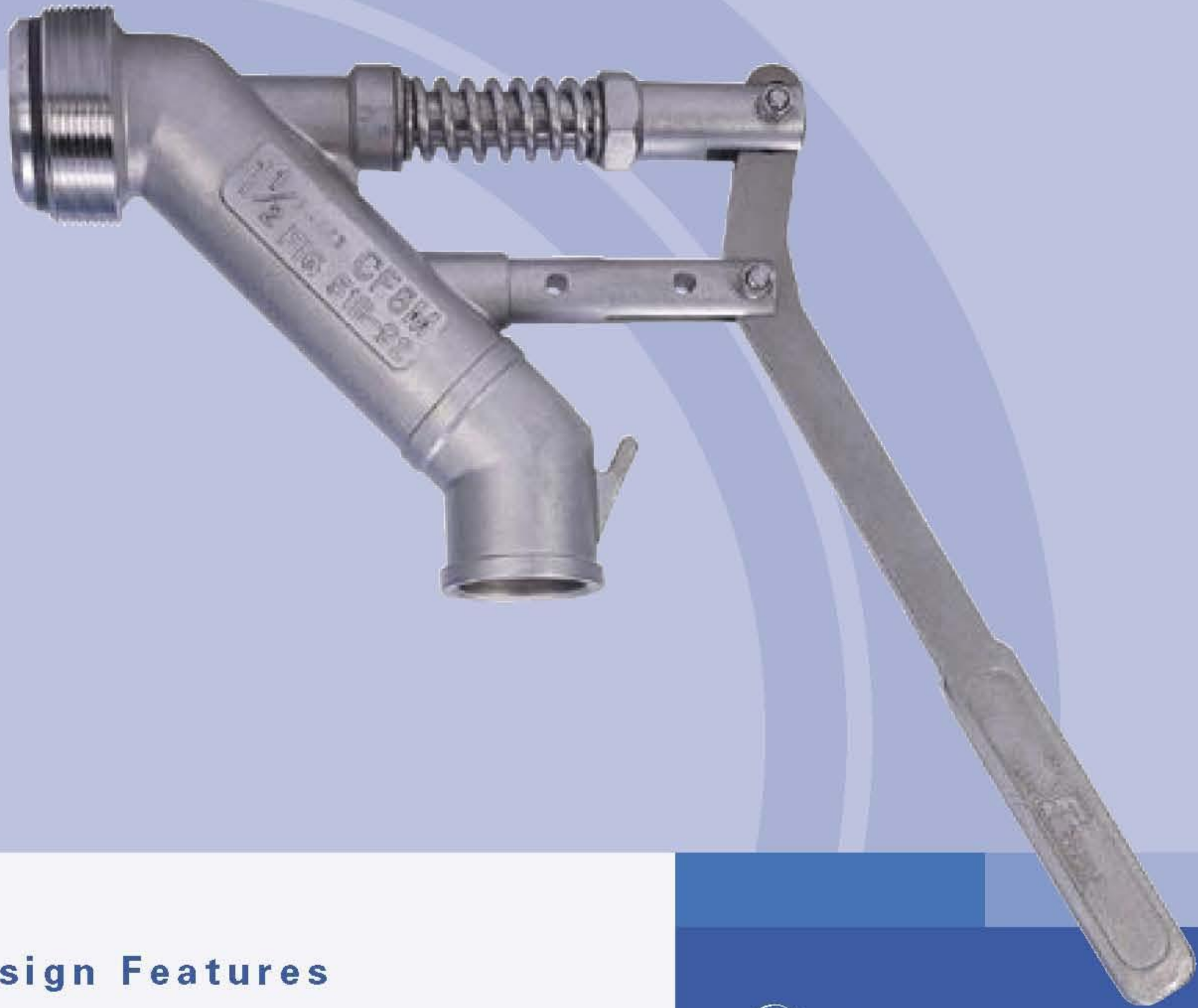
FIG. NO. 51B (CF8M) RESILIENT SEAT - LEVER OPERATED